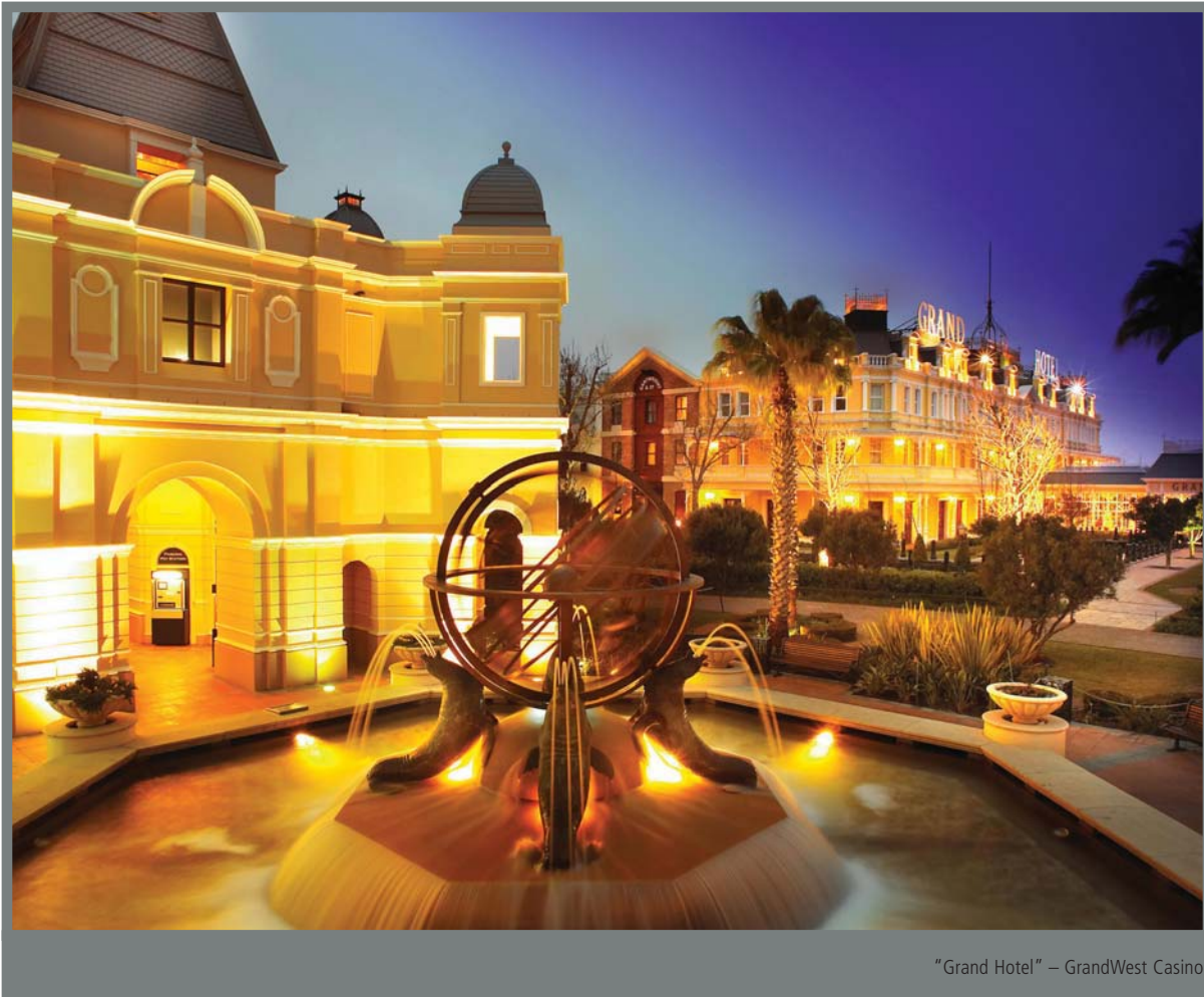
"Grand Hotel" – GrandWest Casino

Charl's legal expertise, in particular, will also add to the skills base of the GPI board.