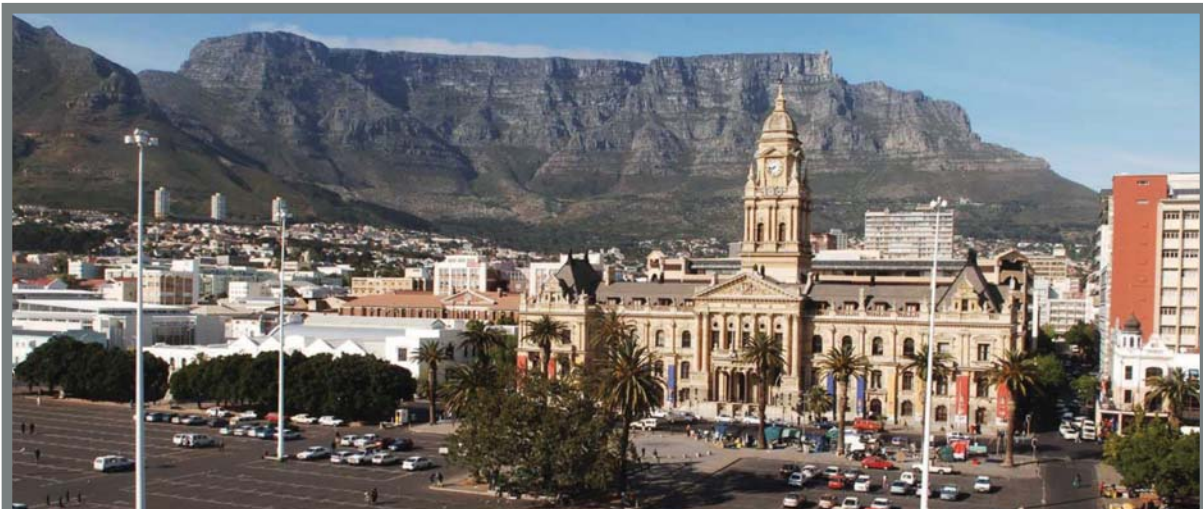
City Hall, Grand Parade