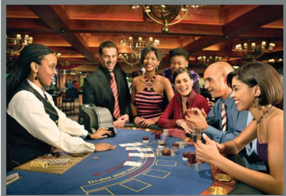
Blackjack table – GrandWest

“The listing was also a coming of age for the company.”