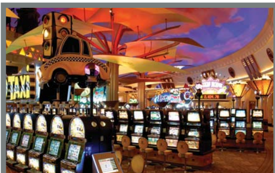
Sibaya Casino Slots

In July post-balance sheet, GPI announced that it was increasing its direct shareholding in SunWest from 26,41% to 29,24%, in a R92,4 million purchase of 560 000 shares. It is also most pleasing that as a result of the RAH transaction, GPI's effective stake in SunWest has increased to 33,7%.