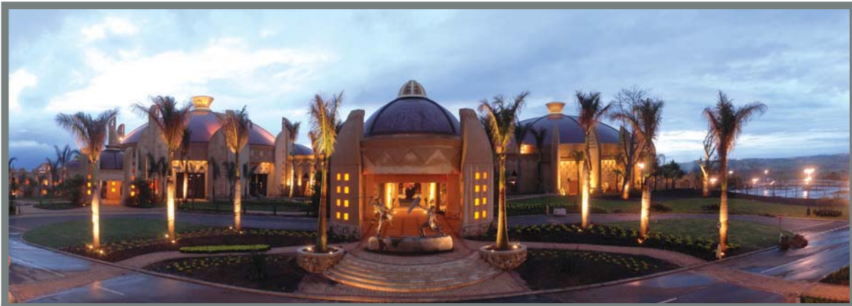
Sibaya Lodge Exterior